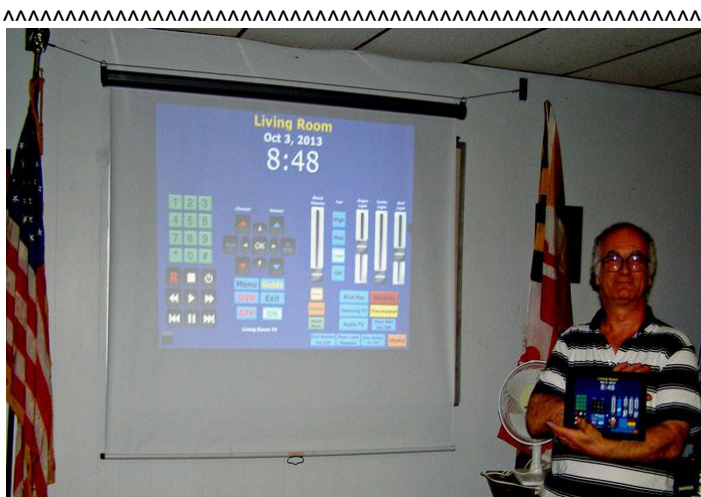
Ken KA3POX gave an excellent presentation about home automation at AARC Oct 3 meeting

Thursday December 19, 2013 7:30 PM - NO Club Meeting - Enjoy the holidays!