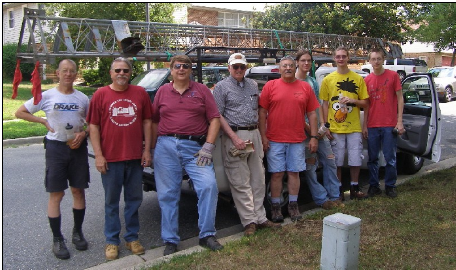
Left to right are: W3MC, KK4GV, W2GPS, K3ACT, KB3NQY, 3 sons of W3MC