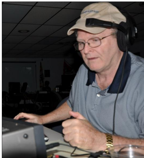
AA3RR operating KI3DS at 0530 (self portrait)

By 11:30 the girls needed only six sections for their "sweep" (NLI, SNJ, DE, AK, BC, and NL) and the guys needed only four sections for theirs (VI, DE, ID and AK).