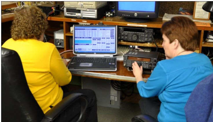
KB3ATI and KB3NGU operating the YL station (KB3ATI)

Despite our best plans which were overcome by events, each station got on the air about an hour after the contest officially started.