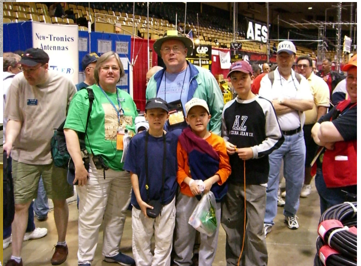
KB3YLW with K3TH and Harmonics