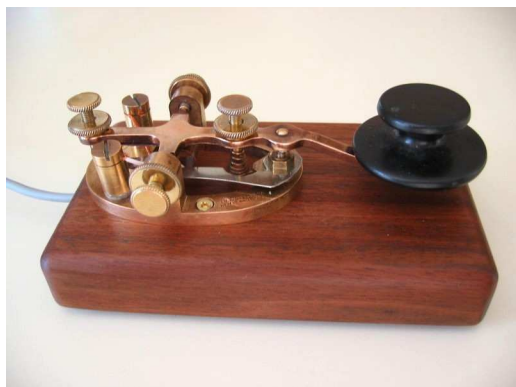
Bunnell Spark Key

As you can see, I operate CW and have been doing so since June of last year. I am now 100% CW and am on the air daily. I built the two rigs on the left, K2 on the bottom and K1 on top. To the right of that are a couple of MFJ tuners and another kit radio I built from Small Wonders Lab's, the DSWII 40 meter version. To the right of that is a Yaesu FT2800M 2-meter rig. Bottom left is an old Icom R71A shortwave receiver and my Yaesu FT897 is to the right of that. The chrome paddle is a Vibroplex Presentation model; the brass one in front is a Begali Simplex and gets the most use. To the right of that is a 1920's Bunnell Spark Key that my grandfather used in the late 20's to early 30's. Use this link for a close-up view of the Bunnell: http://home.comcast.net/~fairbank56/key.html To the right of that is my homebrew "paperclip" paddle which works surprisingly well. Here's a link for that one: http://home.comcast.net/~fairbank56/clipper.jpg The little black box is a kit keyer that I built. On the right is an Icom PS60 power supply, MFJ TNC for APRS and another small power supply on top. I have several hundred QSL cards on the wall as I really enjoy that part of the hobby. I'm really glad I found the magic of CW. I'm up to 30wpm in a little over a year so it's not as hard as you might think. Give it a try and you might just get hooked like I did.