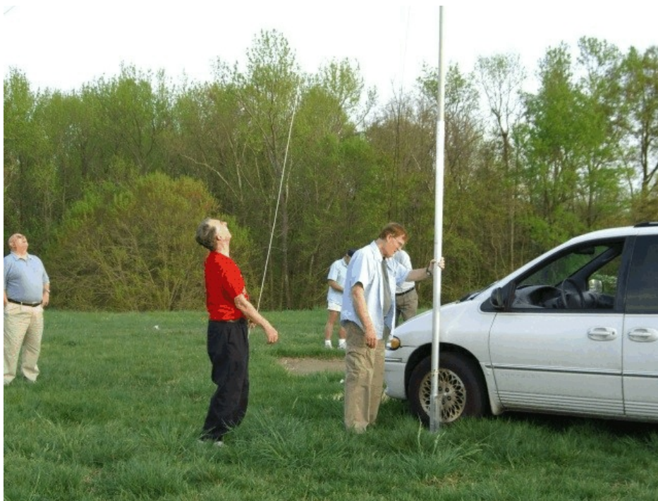
Club members try out new mast system for Field Day